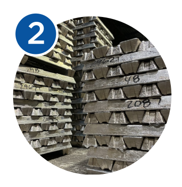
Scrap is cleaned and transformed into shiny new ingots