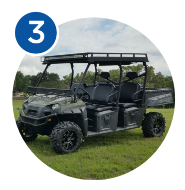
Our customers turn ingots into products you know and love