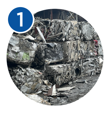
End-of-life scrap aluminum arrives at Spectro